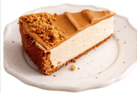
Lotus Cheese Cake

Come and discover the taste of happiness!